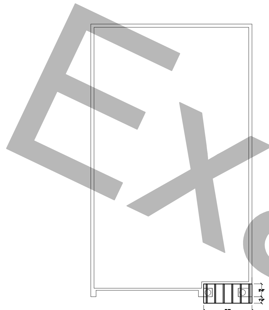
① ROOF FRAMING PLAN ON FIRST FLOOR